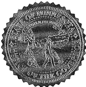
Tim Walz Governor