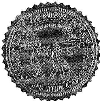
Steve Simon Secretary of State

Filed October 27, 2023 Office of the Minnesota Secretary of State Steve Simon