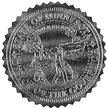
Tim Walz Governor