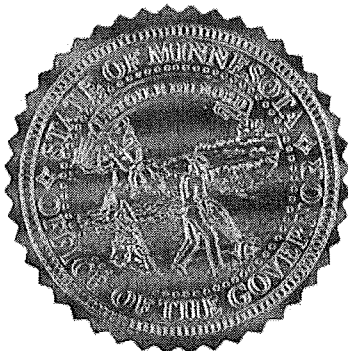
Tim Walz Governor