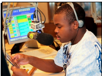
A North High student announcing on KBEM/Jazz88