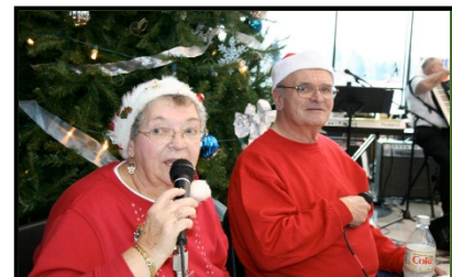
KSRQ's "Saturday Morning Barn Dance"