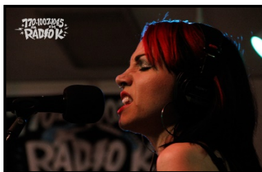
A band performs live from "Studio K" (produced by students) on Radio K