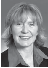
President of the Senate-Designate Michelle L. Fischbach